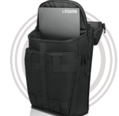
Lenovo Legion Active Gaming Backpack