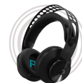
Lenovo Legion H300 Stereo Gaming Headset