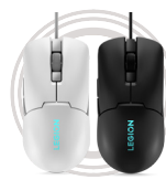
Lenovo Legion M300s RGB Gaming Mouse