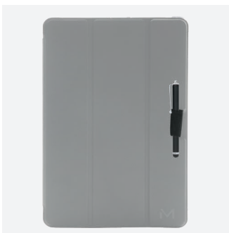
Stylus not included