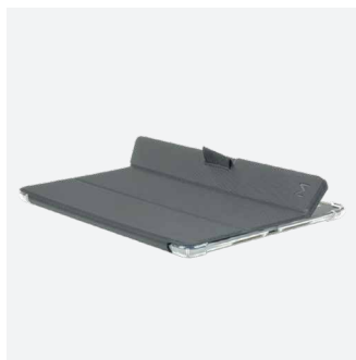
Automatic sleep & wake mode