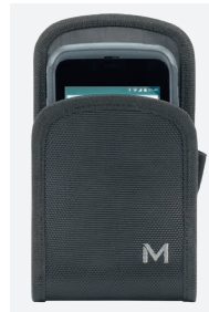
Holster size S Ref. 031001