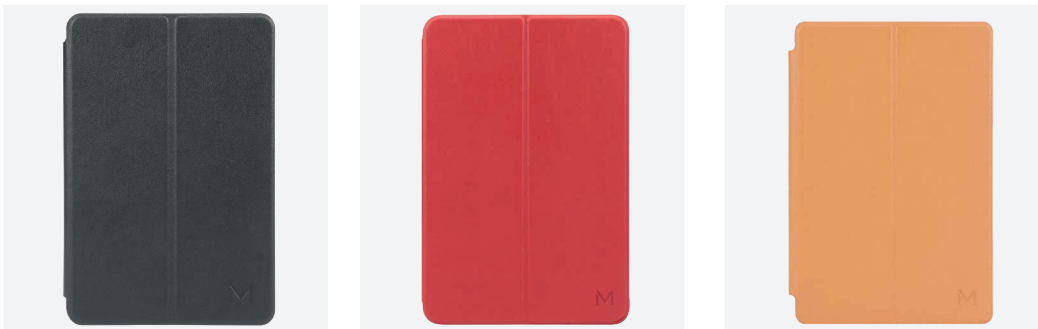
Black - Ref : 048028