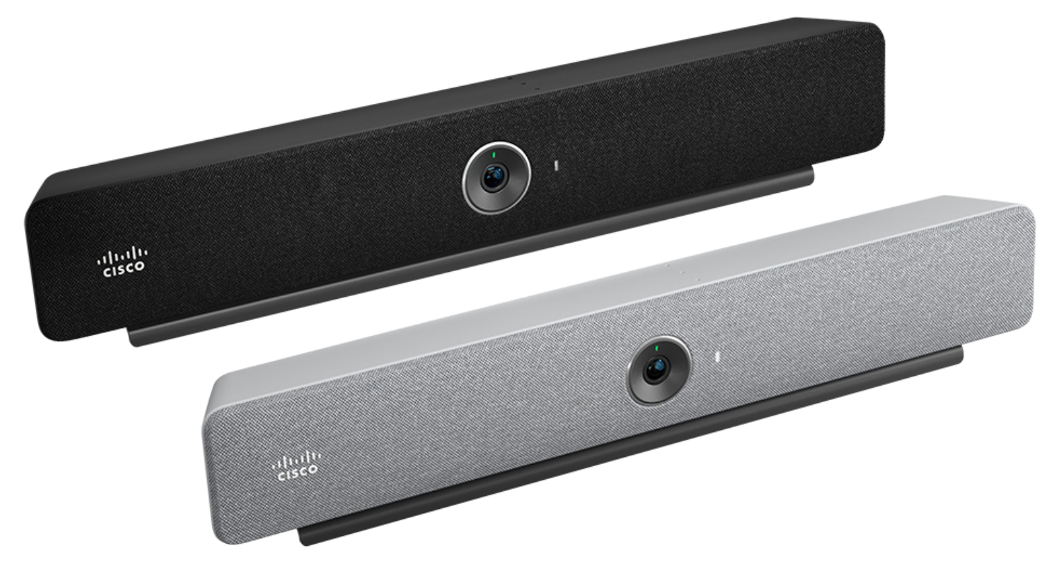
Figure 5. The Webex Room Bar main unit in First Light Gray and Carbon Black color options.