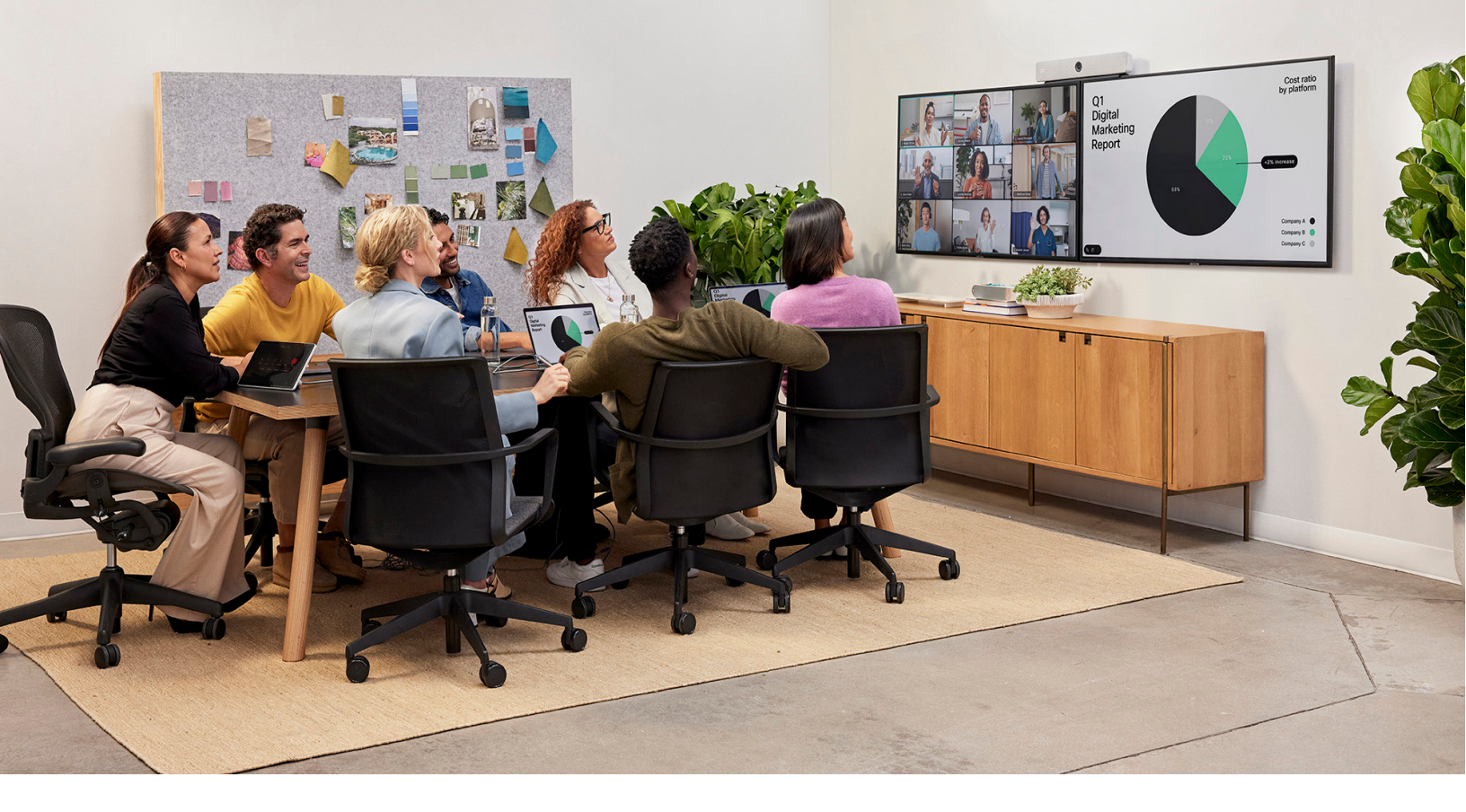
Figure 2. Webex Room Bar paired with dual flat screen displays for video meeting and content sharing in a meeting room