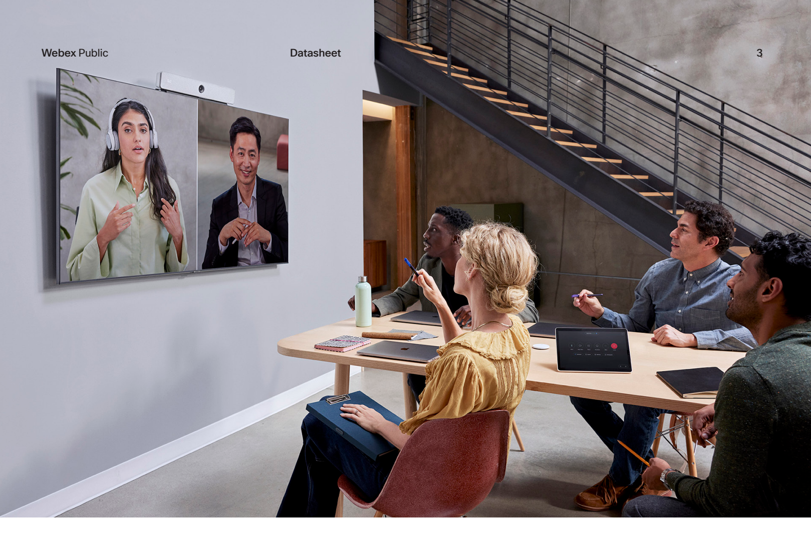
Figure 1. Webex Room Bar paired with dual flat screen displays for video conferencing in an open huddle space

Webex<sup>®</sup> Room Bar powers your best video meetings ever, in a bar. It is a compact yet powerful video collaboration device providing stunning video conferencing, boundless flexibility, and inclusive meeting experiences in your focus rooms, huddle spaces, and small meeting rooms.