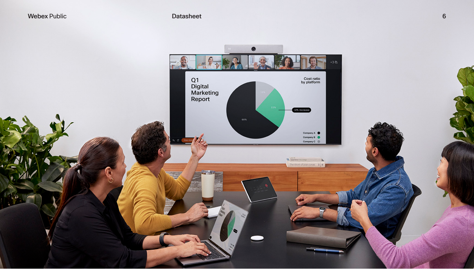
Figure 3. Webex Room Bar used for video conferencing in a small conference room