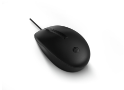
HP 125 Wired Mouse

Think how much you use your mouse. That's why we've taken the time to design a wired mouse that is comfortable to use so you can work productively every day - and all day if necessary. Product number: 265A9AA