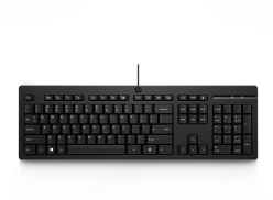
HP 125 Wired Keyboard

Think how much you use your keyboard. That's why we've taken the time to design a keyboard that is comfortable to use so you can work productively every day - and all day if necessary. Product number: 266C9AA