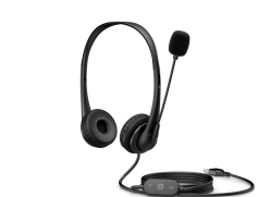
HP Stereo USB Headset G2

Plug right in and get ready to speak and hear clearly all day. With noise-cancelling, comfortable design, and easy adjustment, your sound comfort will carry you from call to call without interference or frustration. Product number: 428K6AA