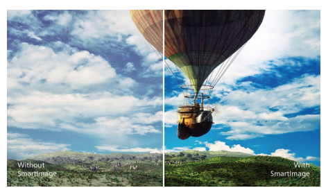
SmartImage is an exclusive leading edge Philips technology that analyses the content displayed on your screen and optimises your display

performance. This user-friendly interface allows you to select various modes, like Office, Photo, Movie, Game, Economy etc., to fit the application in use. Based on the selection, SmartImage dynamically optimises the contrast, colour saturation and sharpness of images and videos for ultimate display performance. The Economy mode option offers you major power savings. All in real time at the touch of a single button!