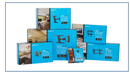
Comes in color packaging with included installation hardware and easy to follow instructions.

**Requires display to be removed and reset on mount