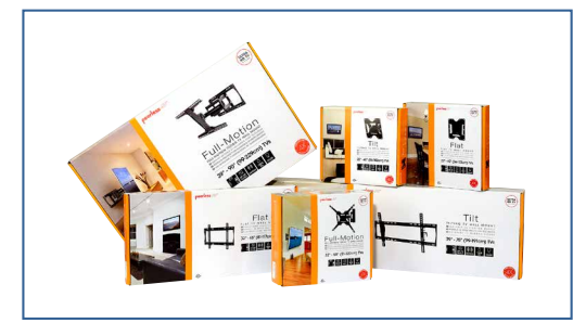
Comes in color packaging with included installation hardware and easy to follow instructions.

**Requires display to be removed and reset on mount