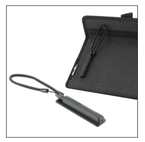
001080 - Pack of 10 Adhesive Stylus Holder with universal capacitive stylus and spiral cord