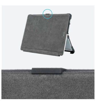
Holding lug for manufacturer's keyboard