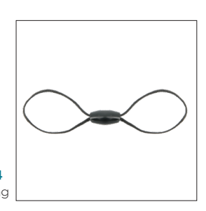
001050 - Pack of 4 Soft Ring