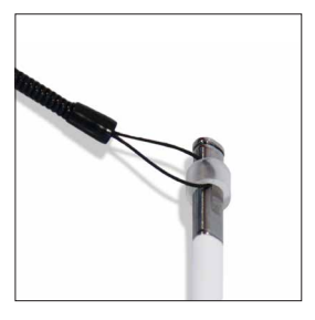
001033 - Pack of 10 Spiral cord & elastic tube