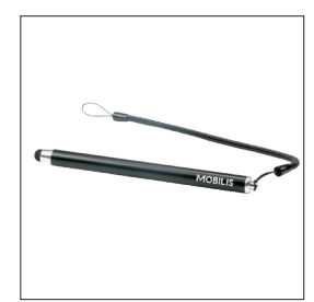
001054 - Pack of 10 Capacitive stylus & spiral cord