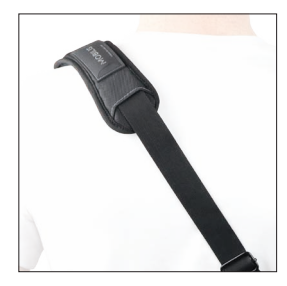
001027 Shoulder strap with break away system 2 attachment points