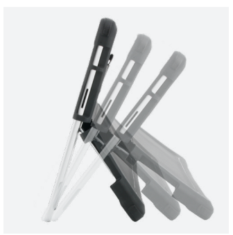
Integration of the tablet's tripod into the shell for multiple tilting