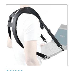
O01026 Harness ergonomic 4 attachment points