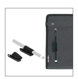
001081 Universal adhesive holder for stylus or pen