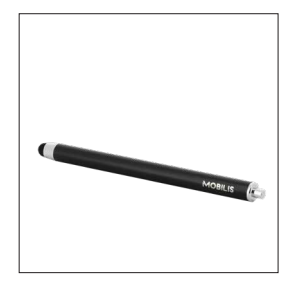
001053 Capacitive stylus per unit