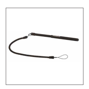
001030 - Pack of 10 Retractable capacitive styluses & spiral cord