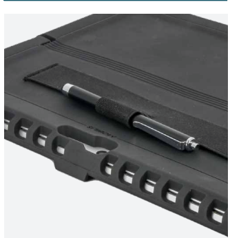
*Stylus not included