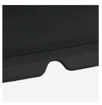
Notch for opening the tripod