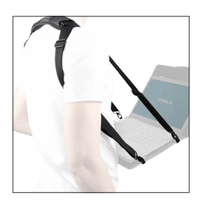
O01024 Typing and transport shoulder strap 4 attachment point