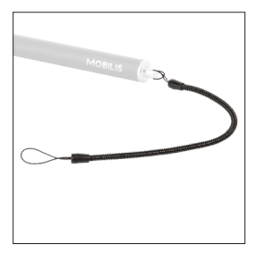
001032 - Pack of 10 Spiral cord