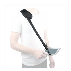
001048 Basic shoulder strap with 4 soft rings 2 attachment points