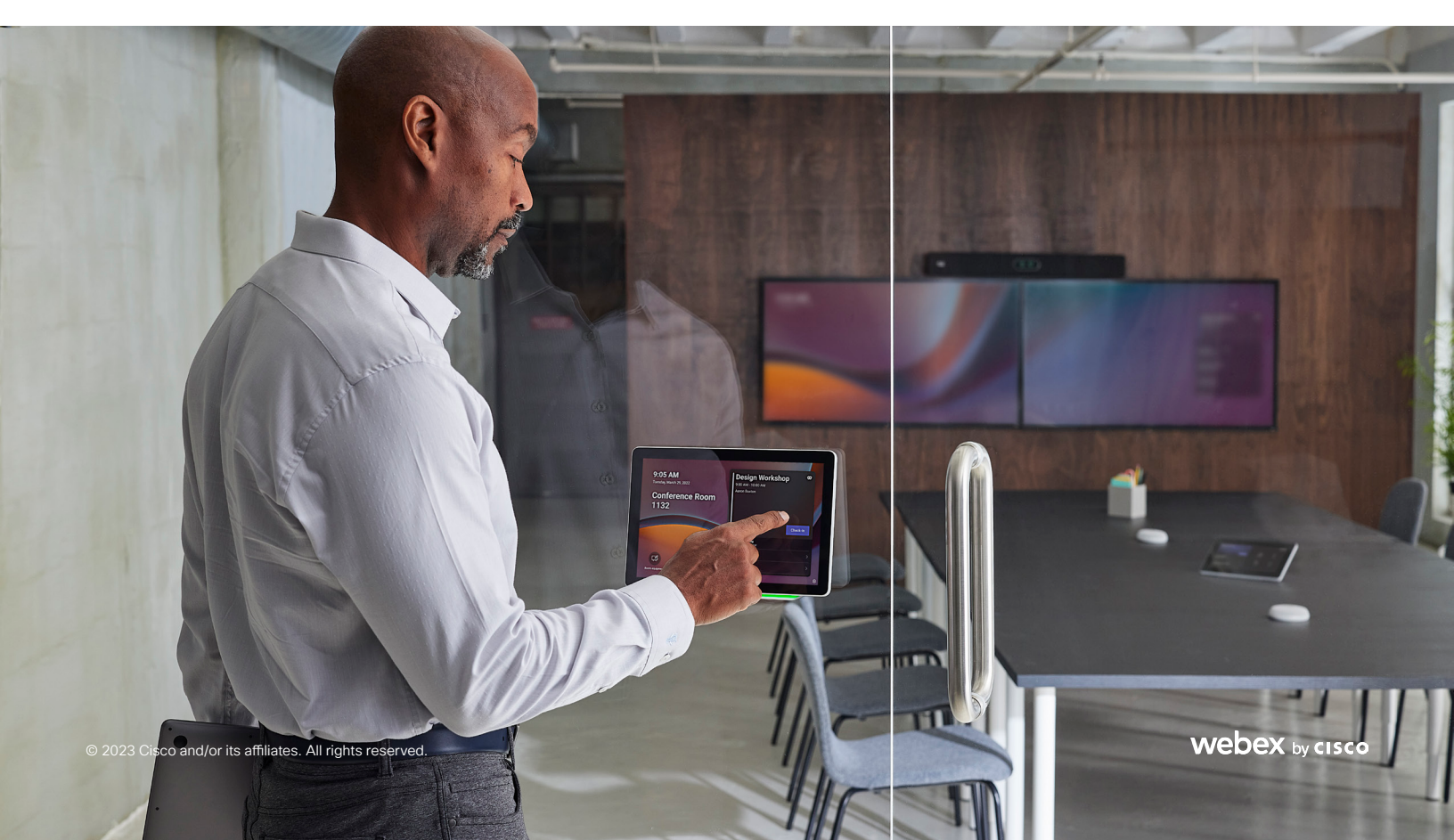
Figure 4: Room Navigator powering the Microsoft Teams Panel experience