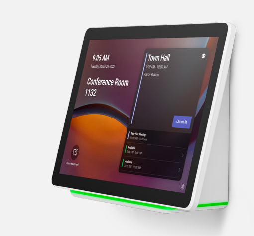
Figure 3: Room Navigator deployed as a native Microsoft Teams Panel

And when using the native Cisco solution for room booking, you can significantly simplify your deployment, lower total cost of ownership and ease management efforts by leveraging a single vendor to provide platform agnostic video collaboration devices, the underlying meeting service, the room control hardware, and the associated room booking software solution.