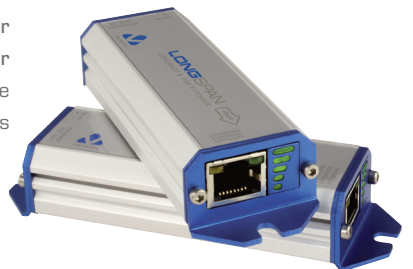
Example 2. Smart LED display shows SafeView™ technology.

NOTES: Range is for typical 24AWG Cat 5e or 23AWG Cat 6, 4-pair UTP | For other cables types, or any installations over 600 metres length, consult Veracity for recommendations or test on site | Distances may be increased by connecting multiple links in series | Data rate at full range stated: 1008 as e-T=200 Mbps, 108 as e-T=200 Mbps