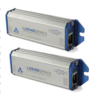
Example 1. LONGSPAN BASE and CAMERA are sold separately.

For network-only applications, the same non-POE model is fitted at each end of the link. For network and power delivery, Base and Camera POE units are used together. A POE switch or separate POE injector may be used as the Base power source. Maximum power and range is achieved with the optional 57V Veracity PSU, enabling the LONGSPAN Base unit to become the POE injector for the link.