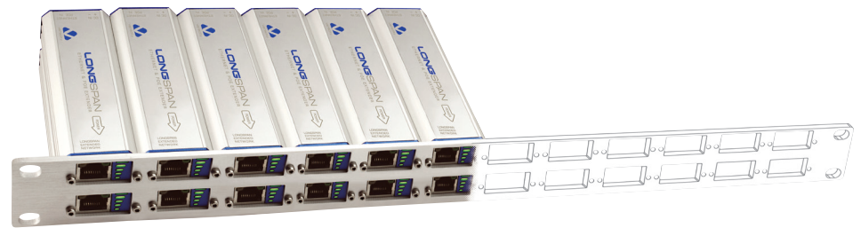
Up to 24 LONGSPAN units can be mounted in a 1U rack space.