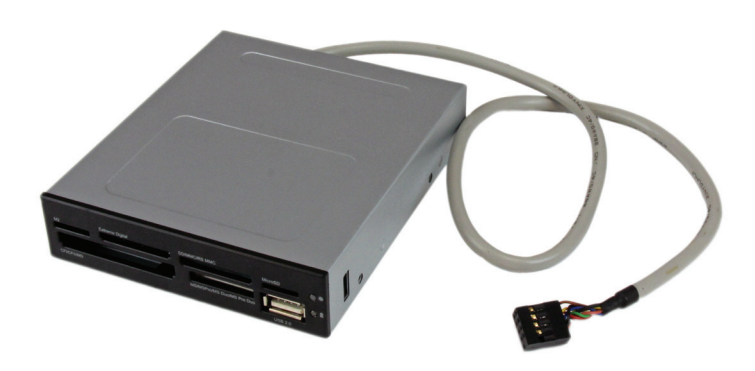
*actual product may vary from photos