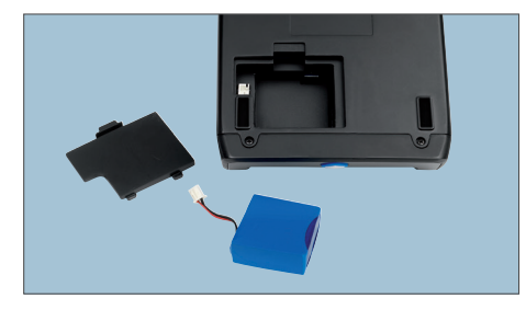
IDEAL FOR PORTABLE USE