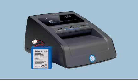
SUITABLE FOR SAFESCAN 135I, 145IX, 155I & 165I