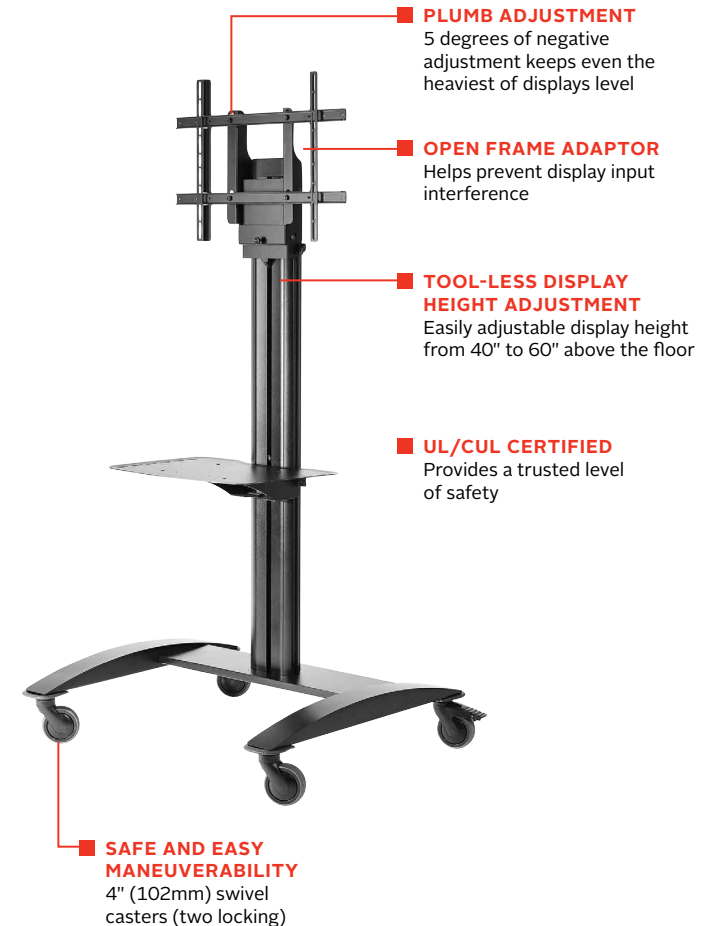
meet UL/CUL requirements

The SR575M SmartMount® Full Featured Flat Panel Cart takes our standard cart to the next level, making everyday usage more enjoyable. Height adjustment of the display and component shelf can be done without the removal of the display - Simply reposition the display to your desired height. Non-marring bumpers on each corner of the cart make it easy to move from room to room, while the UL® certification ensures that it can be done safely.