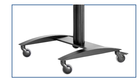
Shown with Optional Caster Accessory Kit: ACC979