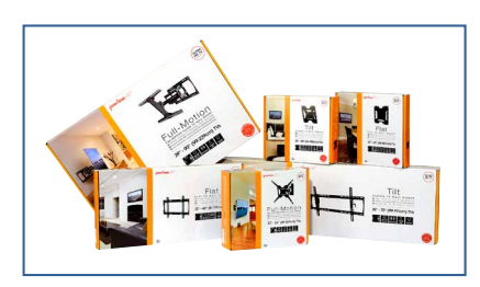
Comes in color packaging with included installation hardware and easy to follow instructions.

Swivel, tilt, extend or retract the display for the perfect viewing angle.