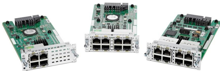
Figure 1. 4-Port, 8-Port, and 8-Port PoE/PoE+ Cisco Gigabit Ethernet LAN Switch Network Interface Modules

The new features for the Gigabit Ethernet LAN Switch NIMs include four quality-of-service (QoS) queues per port, Shaped Deficit Weighted Round Robin (SDWRR), dynamic secure port, intra chassis cascading, up to 30W of PoE/PoE+ per port, and PoE per-port monitoring and policing.