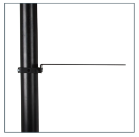
Compatible with BT7052 and BT7260 Accessory Collars for use with ø50mm or ø60mm poles (sold separately)