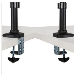
Supplied with a desk clamp that can attach either to the rear or side of a desk or through a grommet hole