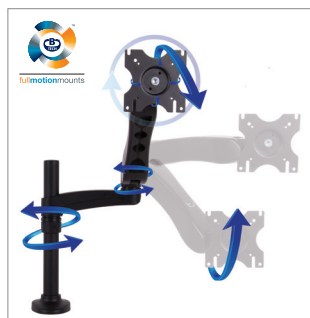
Full motion adjustability allows easy screen positioning for the perfect display position