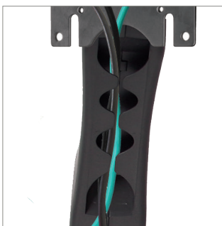
Cable management is integrated throughout the mount for a neat and tidy installation