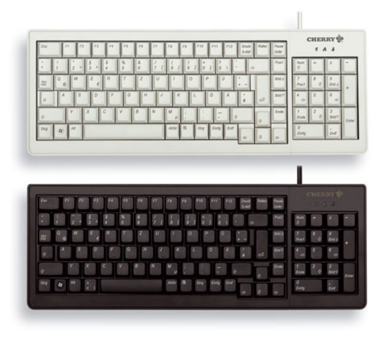
Models may vary from the image shown