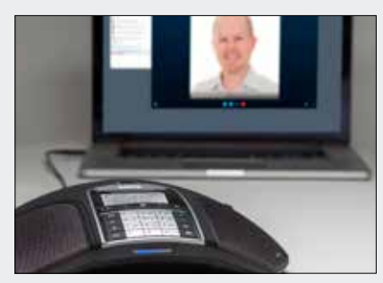
Perfectly compatible with Skype for Business, Cisco, Avaya and other meeting tools on your laptop.