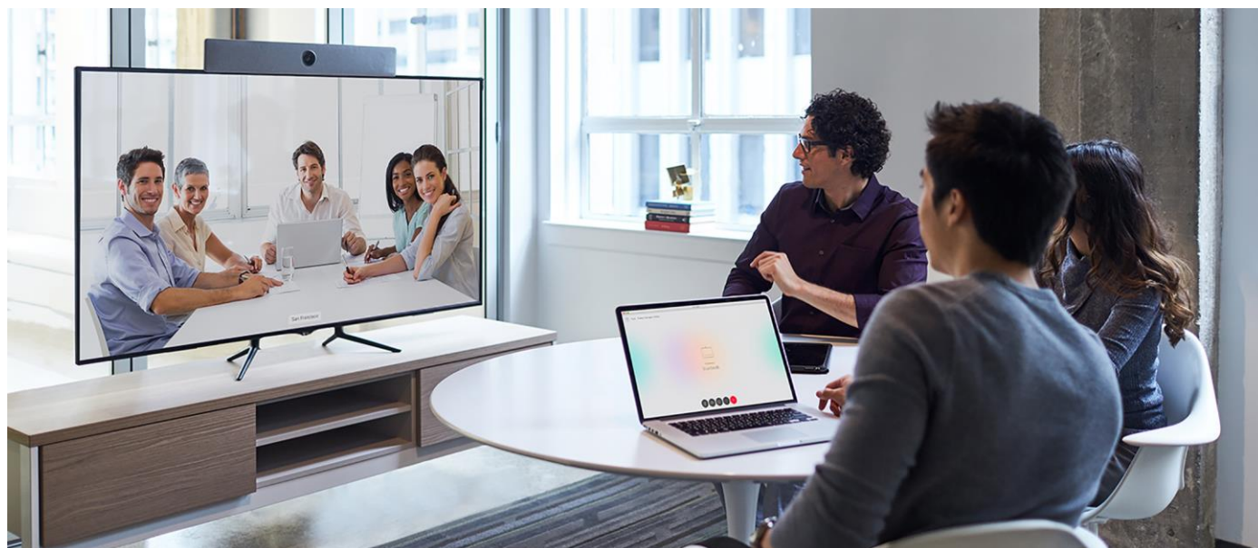
Figure 1. Cisco Spark Room Kit in small room scenario

The Room Kit – which includes camera, codec, speakers, and microphones integrated in a single device – is ideal for rooms that seat up to seven people. It offers sophisticated camera technologies that bring speaker-tracking capabilities to smaller rooms. The product is rich in functionality and experience but is priced and designed to be easily scalable to all of your small conference rooms and spaces – whether registered on the premises or to Cisco Spark through the Cisco® Collaboration Cloud.