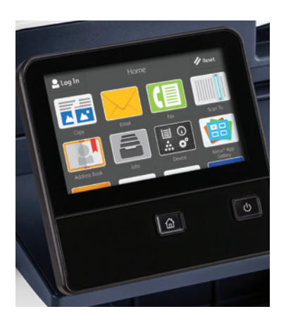
View a demo of our VersaLink device touchscreen at www.xerox.com/ Versal inkUIDemo

This unmatched balance of hardware technology and software capability helps everyone who interacts with our VersaLink printers and multifunction printers get more work done, faster.