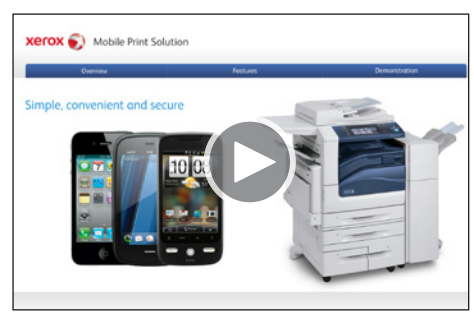
Visit www.xerox.com/MobileDemo to view a demo of the Xerox® Mobile Print Solution.

cloud is offered as a free service or a more advanced for-fee solution. The Basic version offers a ConnectKey® App resident on the user panel and enables a simple email to the cloud to pull print jobs to the multifunction printer. The Enhanced version offers the app with a Mobile Print Cloud license, providing convenient authentication that locks and unlocks a device, via a mobile app, without authentication cards.