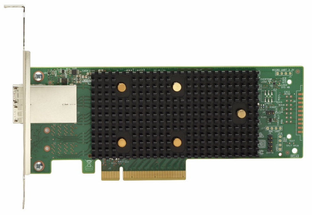
Figure 2. ThinkSystem 430-8e SAS/SATA 12Gb HBA

The following figure shows the ThinkSystem 430-8e SAS/SATA 12Gb HBA.