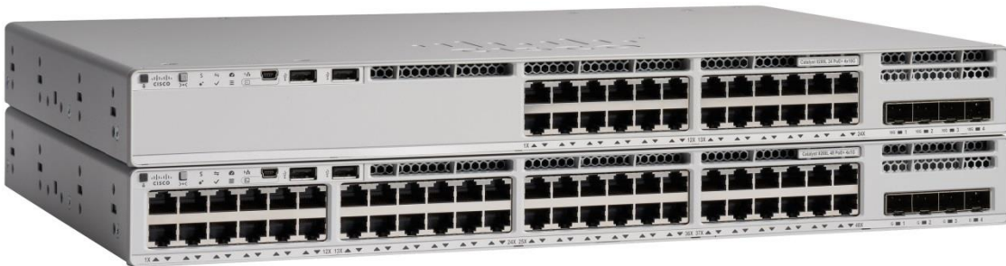
Figure 1. Cisco Catalyst 9200 Series switches

The Cisco Catalyst 9200 Series is made up of four modular (C9200 SKUs) and eight fixed (C9200L SKUs) switch models.