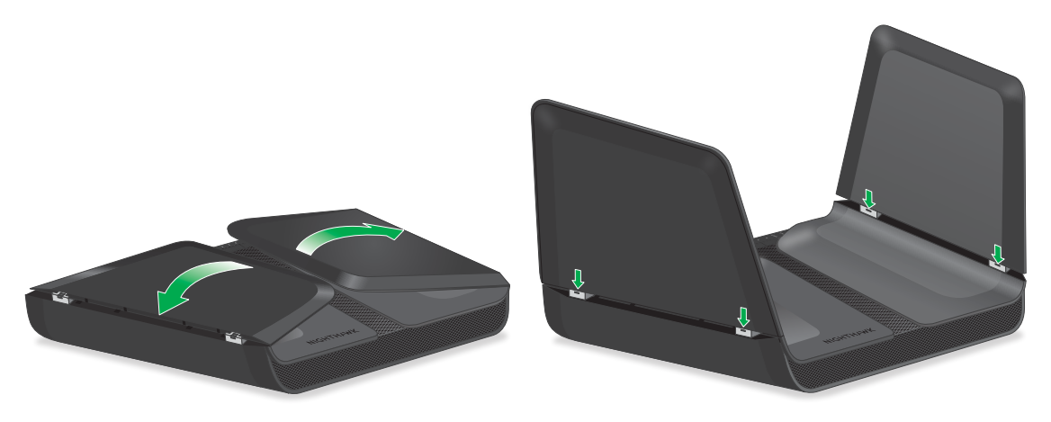
Figure 4. Position the antennas

Before you install your router, extend the antennas as shown in the following figure.