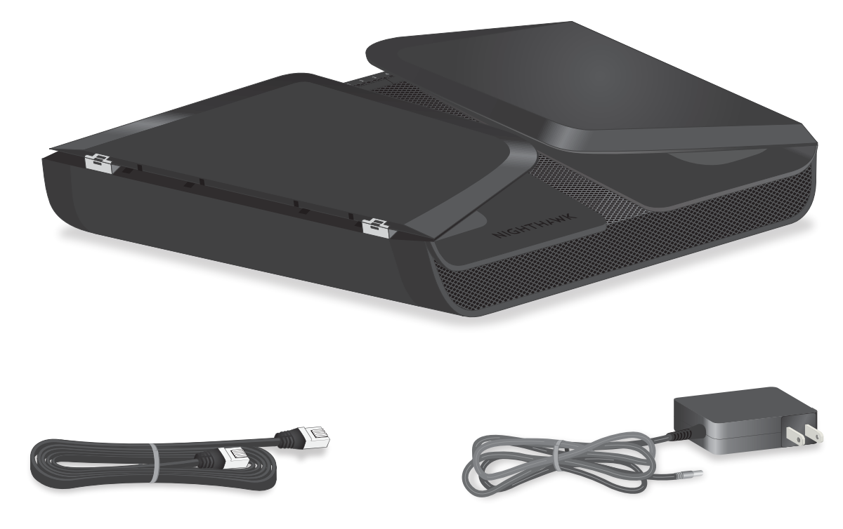
Figure 1. Package contents

Your package contains the router, the power adapter, and an Ethernet cable.