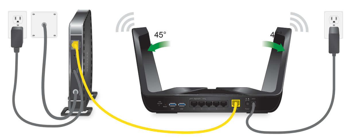
Figure 6. Cable your router

Power on your router and connect it to a modem.