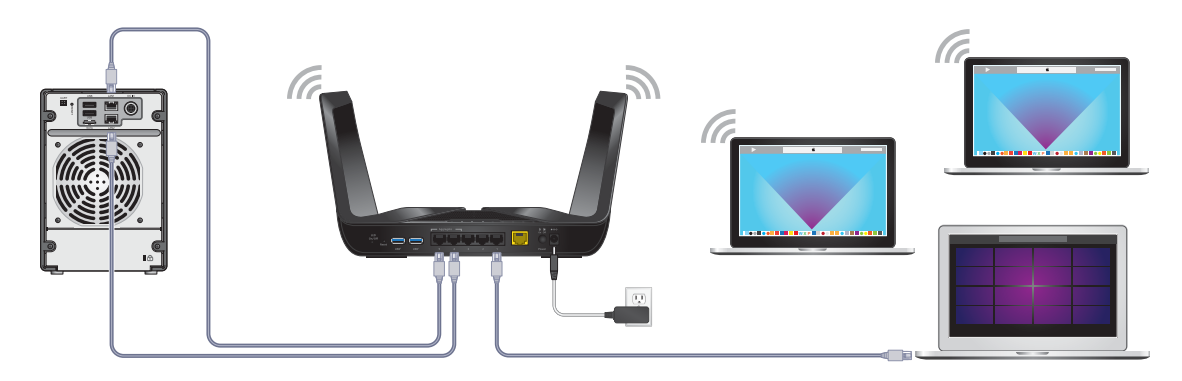
Figure 7. Ethernet port aggregation

Warning: To avoid causing broadcast looping, which can shut down your network, do not connect an unmanaged switch to Ethernet ports 4 and 5 on your router.