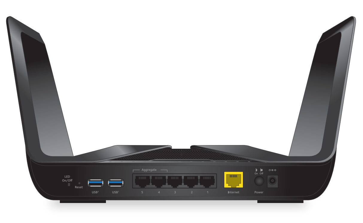
Figure 3. Rear panel

The following figure shows the rear panel connectors and buttons.