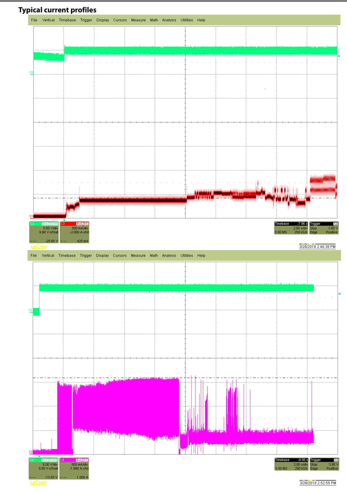
Figure 1. Typical 5V and 12V startup and operation current profiles