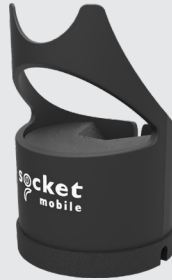
Charging Dock SKU# AC4133-1871