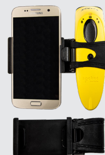
Scanner & Phone Holder