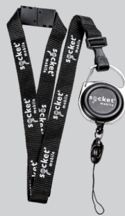
Lanyard - Black AC4100-1692