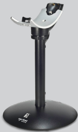
Charging Stand SKU# AC4076-1538