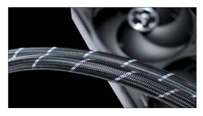
Maintenance-free Water Loop The water loop is sealed, therefore no water or additives have to be refilled.

The Liquid Freezer II Series features an all-new, in-house developed PWM-controlled pump with a copper base, improved efficiency, low power usage and quiet operation.