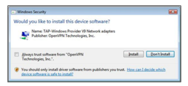
Figure 3. A Windows Security window opens.