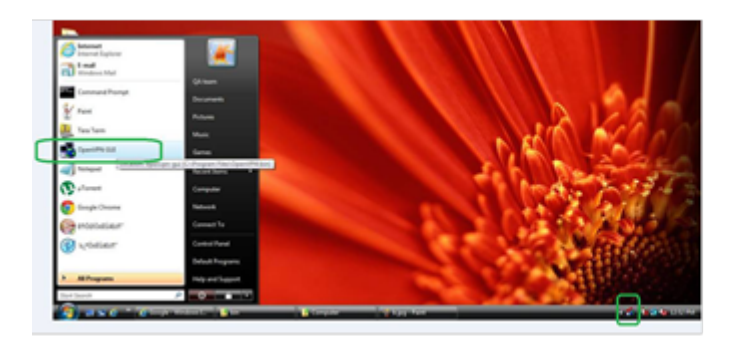
Figure 4. The OpenVPN icon displays in the Windows taskbar.

1. Launch the OpenVPN application with administrator privileges.