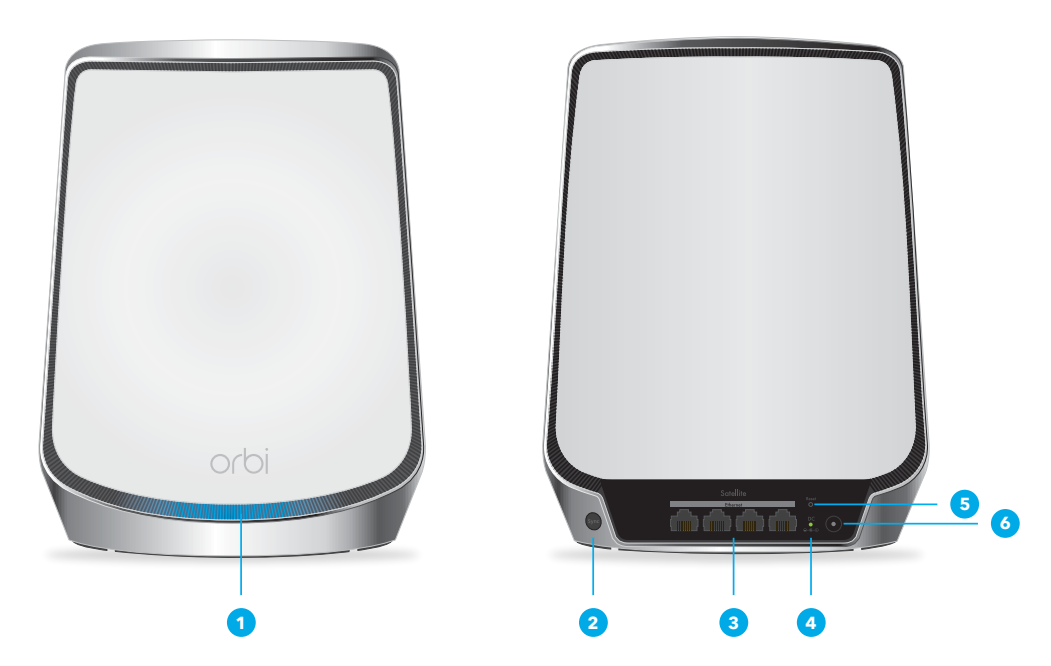
Figure 2. Orbi satellite front and back views

The following figures shows the Orbi satellite hardware features.