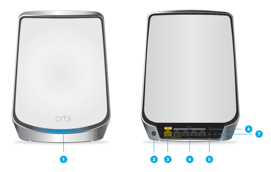
Figure 1. Orbi router front and back views

The following figures shows the Orbi router hardware features.