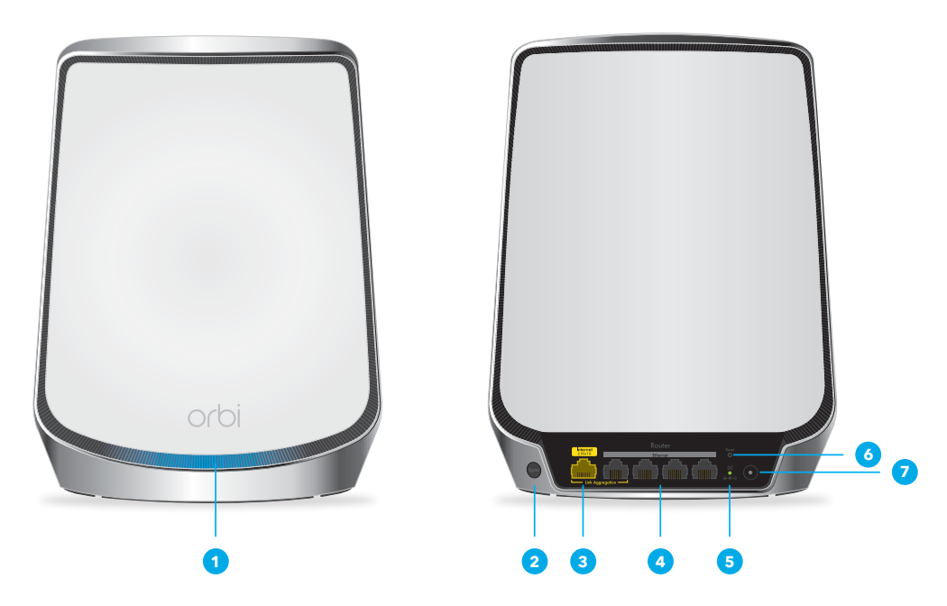
Figure 1. Orbi router front and back views

The following figures shows the Orbi router hardware features.