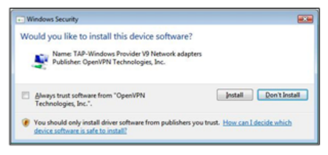
Figure 3. A Windows Security window opens.