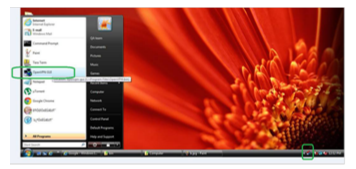
Figure 4. The OpenVPN icon displays in the Windows taskbar.

1. Launch the OpenVPN application with administrator privileges.