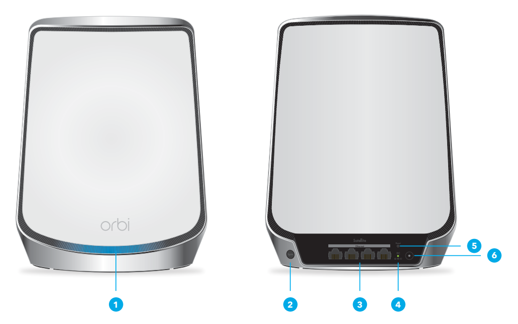
Figure 2. Orbi satellite front and back views

The following figures shows the Orbi satellite hardware features.