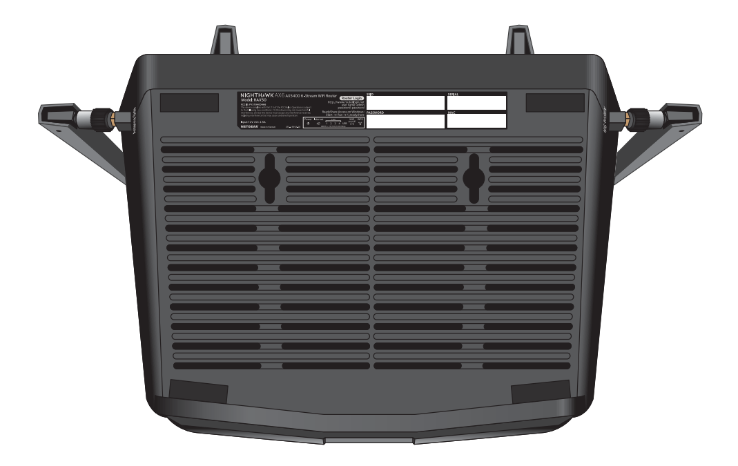
Figure 6. Bottom of the router

Note: We recommend using M3 x 20 mm screws.