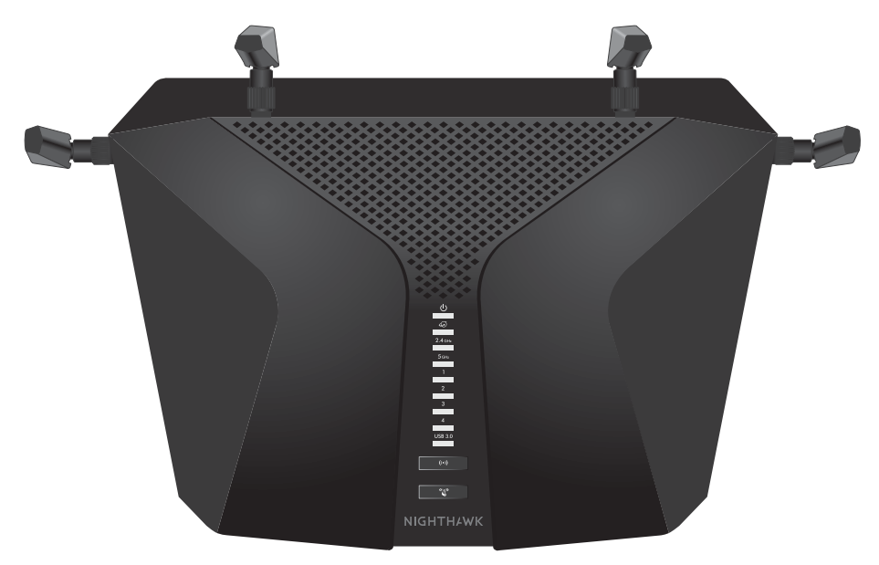
Figure 2. Top view

The status LEDs and two buttons are located on the top panel of the router.