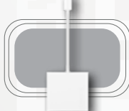
Lenovo USB-C 3-in-1 Hub