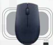
Lenovo 520 Wireless Mouse