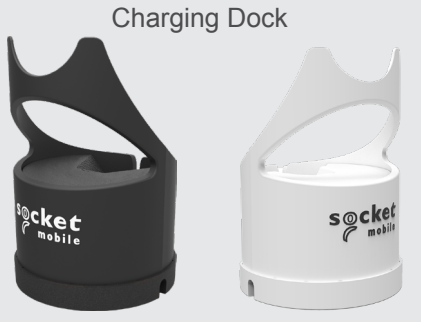
Ideal as a desktop charger