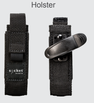
Safe and accessible placement