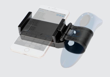
Nice one-handed option