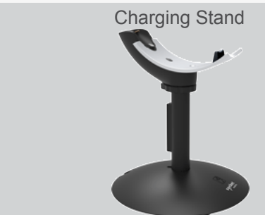
Great for using AutoScan Mode