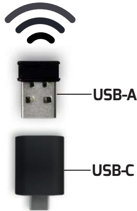
USB-A & USB-C connectivity Connectivité USB-A & USB-C