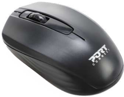
2,4 Ghz Wireless technology Technologie sans fil 2,4 Ghz