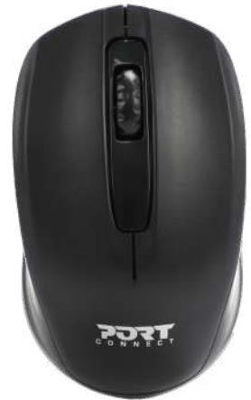
Ambidextrous design Design ambidextre