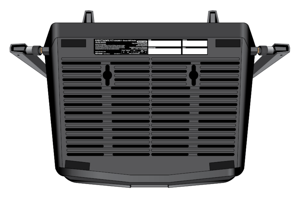
Figure 6. Bottom of the router

Note: We recommend using M3 x 20 mm screws.