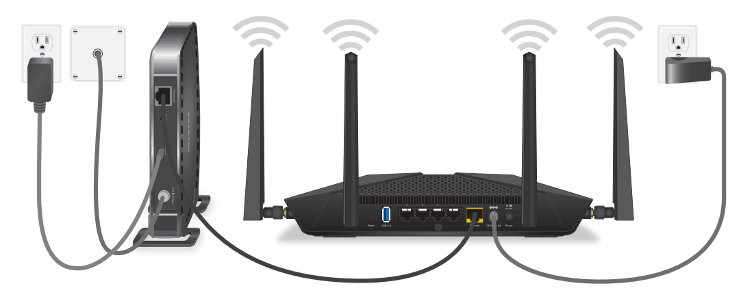
Figure 7. Cable your router

Power on your router and connect it to a modem.