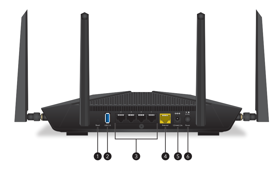
Figure 3. Rear panel

The following figure shows the rear panel connectors and buttons.