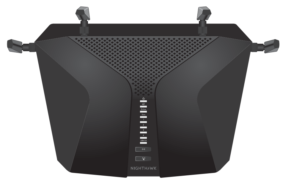
Figure 2. Top view

The status LEDs and two buttons are located on the top panel of the router.