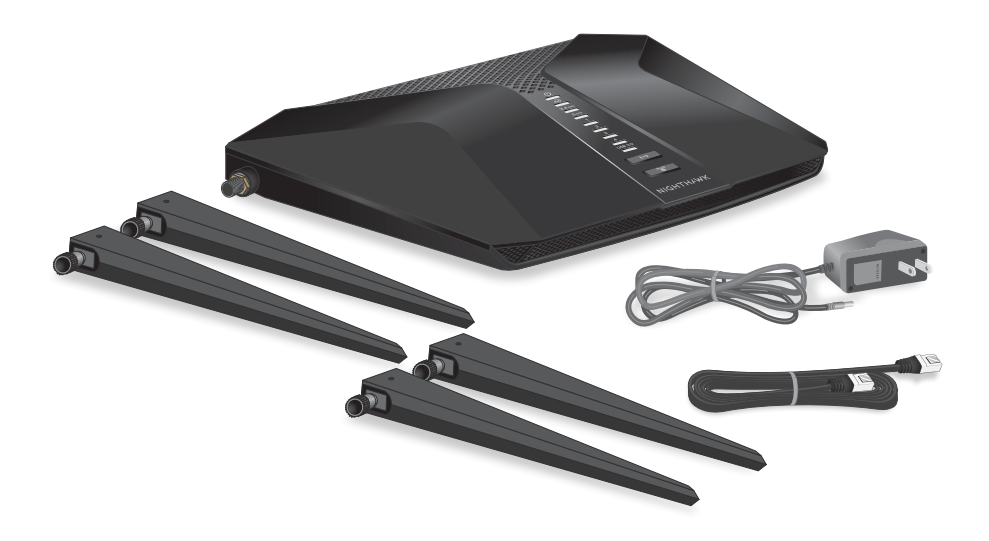
Figure 1. Package contents

Your package contains the router, the power adapter, four antennas, and an Ethernet cable.