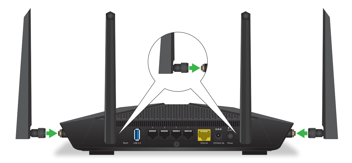
Figure 5. Attach and position the antennas

After you are done attaching the antennas, position the antennas as shown.