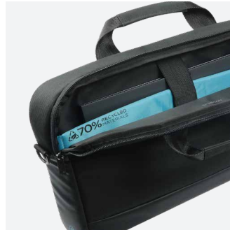
With reinforced laptop compartment