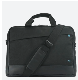
Adjustable and removable