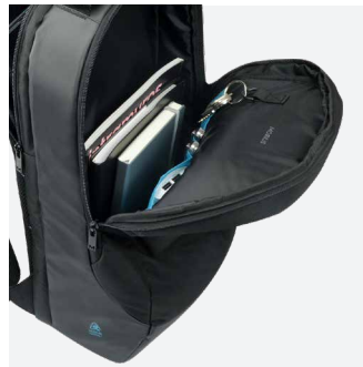
With organizer and keyring