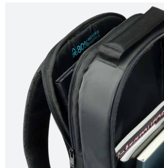
With tablet storage pocket