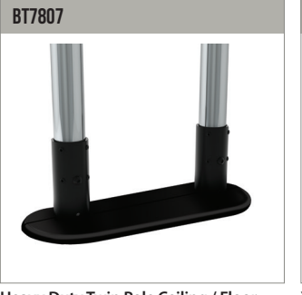
Heavy Duty Twin Pole Ceiling / Floor