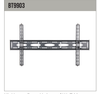
XL Heavy Duty Universal Wall Mount for screens up to 120"