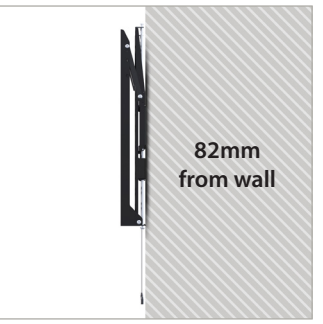
Mounts screen just 82mm from the wall when mounted flat