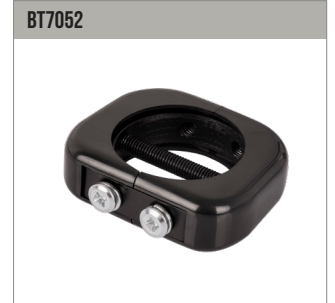
Ø50mm Accessory Collar to attach mounts an accessories to Ø50mm poles