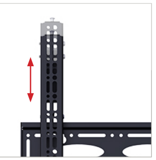
Adjustment screws allow screen to be levelled once mounted