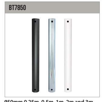
Ø50mm 0.25m, 0.5m, 1m, 2m and 3m Poles available in Black, Chrome and White Mount for Ø50mm poles