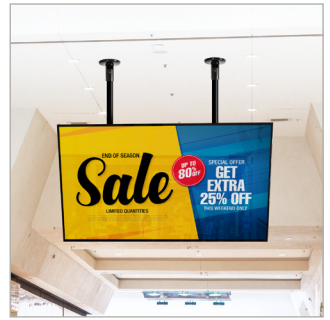
Compatible with B-Tech's collar and pole system for pole mounting heavy duty screens