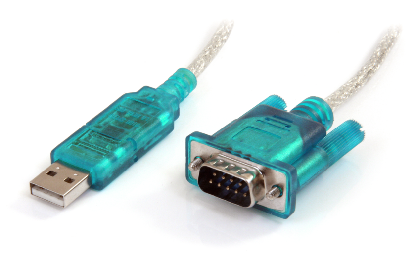
*actual product may vary from photos