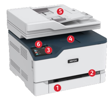
Xerox® C235 Colour Multifunction Printer