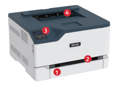
Xerox® C230 Colour Printer