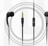
Lenovo 100 In-Ear Headphone