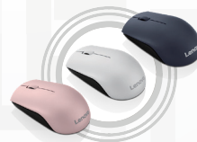
Lenovo 520 Wireless Mouse