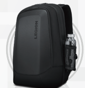
Lenovo 15.6" Laptop Casual Backpack B210