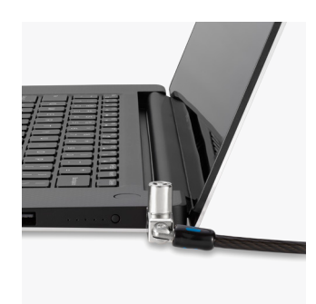
Allows Laptop to Lie Flat and Stable

Allows for full use of the laptop's ports.