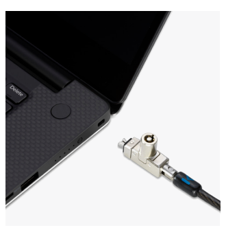
Does Not Block Valuable Ports

Made especially for ultra-thin and 2-in-1 laptops. Tested and approved by Dell.