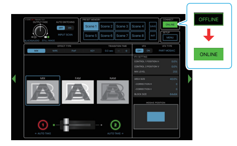
When the status icon changes to "ONLINE," the device is connected.

1. Turn on the iPad and launch V-02HD MK II Remote.