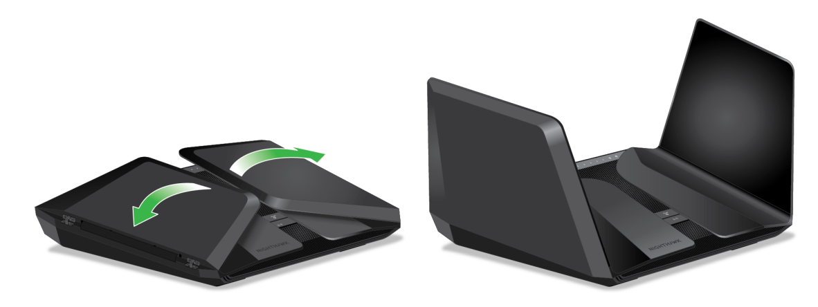
Figure 6. Position the antennas

Before you install your router, extend the antennas as shown in the following figure.