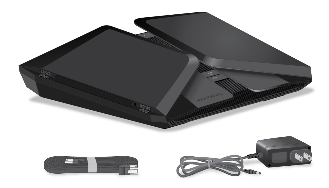
Figure 1. Package contents

Your package contains the router, the power adapter, and an Ethernet cable.