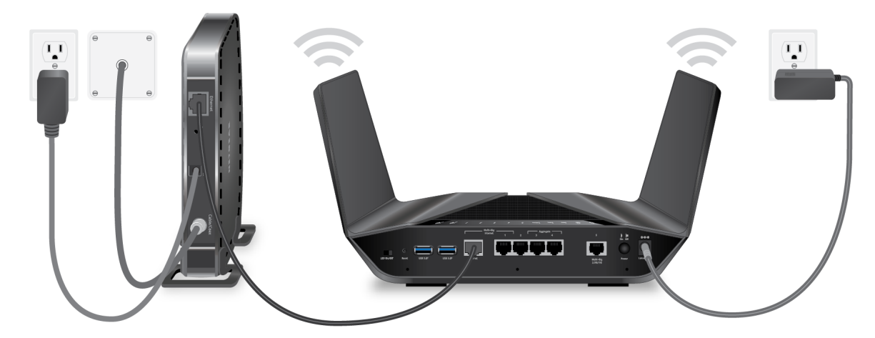
Figure 7. Router connected to a modem

After you connected your router to a modem and powered it on, finish your router's installation process using the Nighthawk app or router web interface. For more information, see <u>Connect to the network and access the router</u> on page 19.