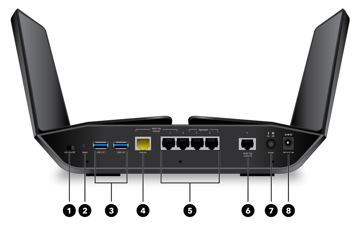
Figure 3. Rear panel

The following figure shows the rear panel connectors and buttons.