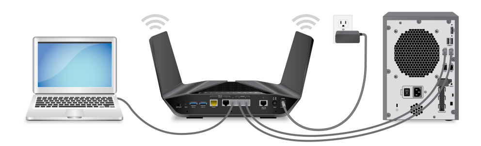
Figure 9. Ethernet port aggregation to a LAN device

WARNING: Do not connect an unmanaged switch to Ethernet ports 3 and 4 on your router if these ports are aggregated. Otherwise, a network loop occurs, and your network might be shut down.