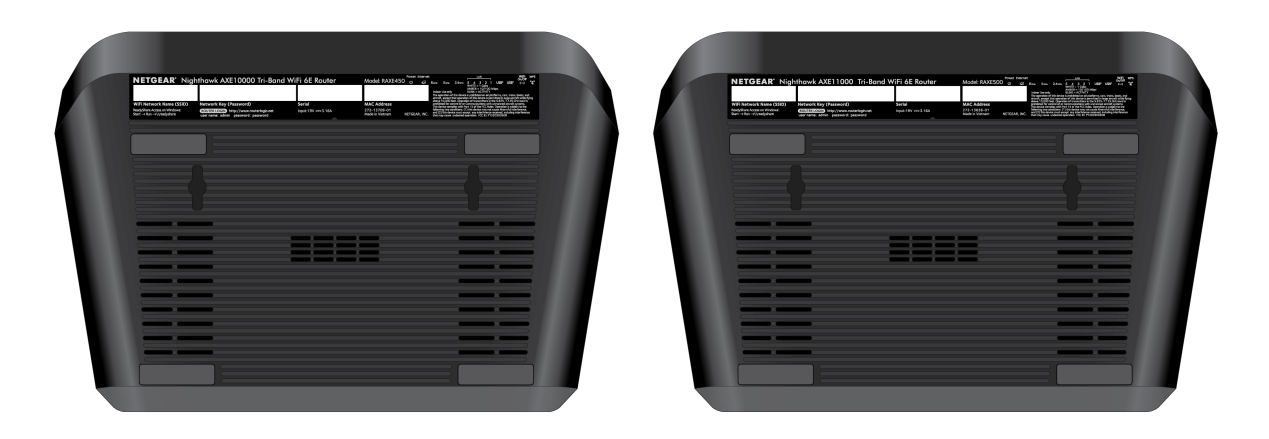
Figure 8. Bottom of the RAXE450 router and RAXE500 router

Note: We recommend using M3 x 20 mm screws.