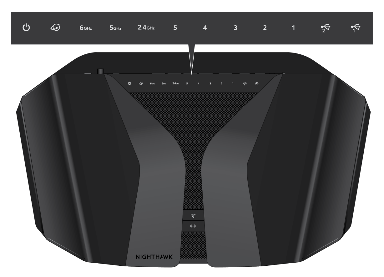
Figure 2. Top view

The status LEDs and two buttons are located on the top panel of the router.