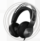
Lenovo Legion H500 Pro 7.1 Surround Sound Gaming Headset