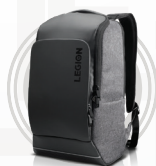
Lenovo Legion 15.6" Recon Gaming Backpack