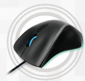
Lenovo Legion M500 RGB Gaming Mouse