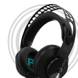
Legion H300 Stereo Gaming Headset