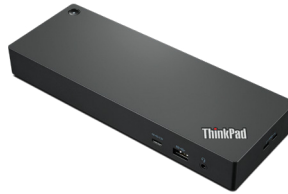
ThinkPad Universal Thunderbolt™ 4 Dock