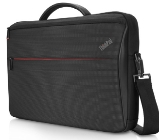
ThinkPad 14-inch Professional Slim Topload