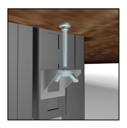
Installing the Wing Fasteners