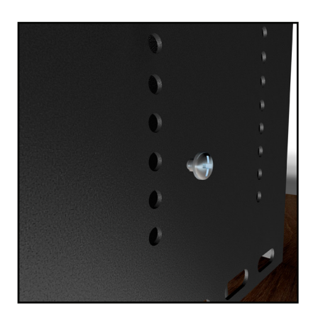
Inserting Module Screws

Note: The eight Module Screws are packaged with the Module.