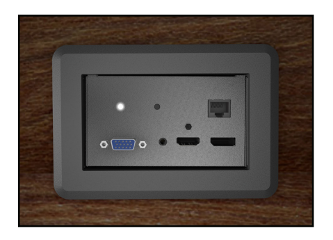
Modular Table Box

Secure the Modular Table Box in place by tightening each of the Wing Fasteners until the top of the nut comes in contact with the bottom of the table's surface, creating a tight seal between the table's surface and the Modular Table Box. Be careful not to overtighten the Wing Fasteners.