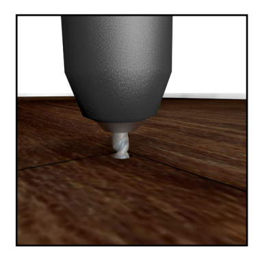
Drill Pilot Holes

5. Using a Drill with a 3/8" Wood Drill Bit , carefully drill pilot holes in each of the four corners of the guide.