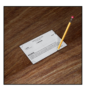
Surface Cut-Out Area

Using a Writing Utensil, trace around the Surface Cut-Out Area to create a guide on the table's surface.