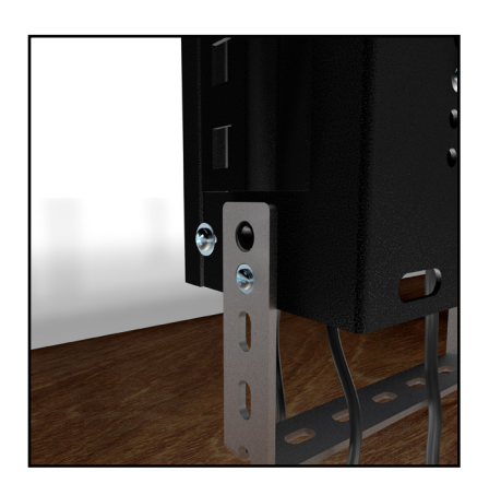
Installing the Lacing Bar

Note: The Modular Table Box has three Lacing Bar mounting options (left, center, and right). Mount the Lacing Bar in the position that best suits your needs.